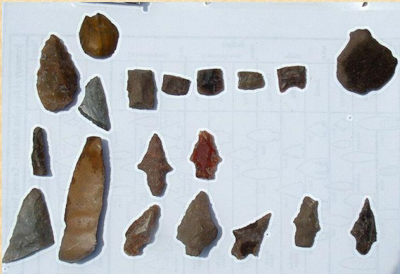
Stone tools and points screened on Saturday April 13