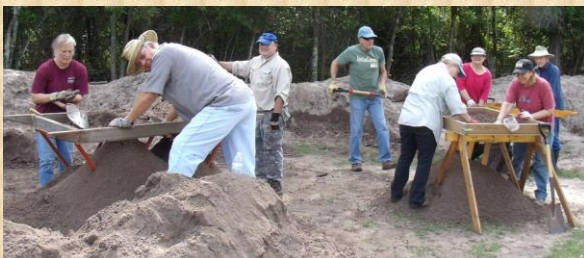
The crew on Saturday – working hard!