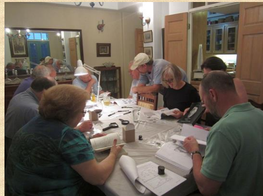
Hard at work identifying artifacts during a weekly Lab session Monday night, April 15.