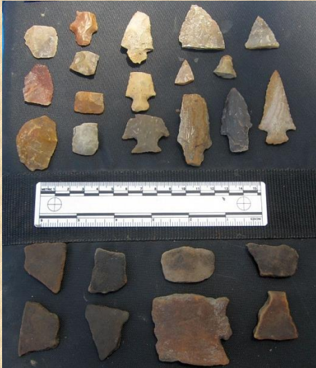
Some of the artifacts found in the screens on Friday, April 12. Points and stone tools above the ruler, pottery below the ruler.